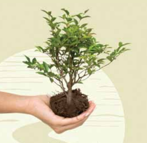
branching out CURBSIDE RECYCLING FOR A NEW CONVERS

Here are some things the Curbside Value Partnership has learned when it comes to educating residents about recycling.