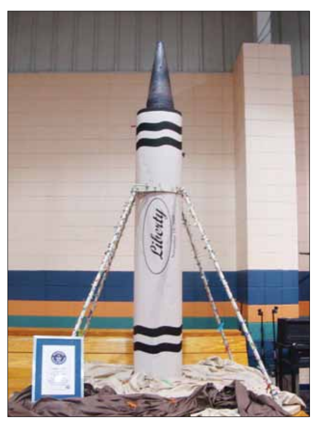
Another Guiness World Record was set by Keep Liberty County Beautiful with the largest recycled crayon.

than 38,000 hours of service on one single day, Lilly's employees have also inspired others in the community to become involved. That's a benefit to our community that is truly immeasurable."